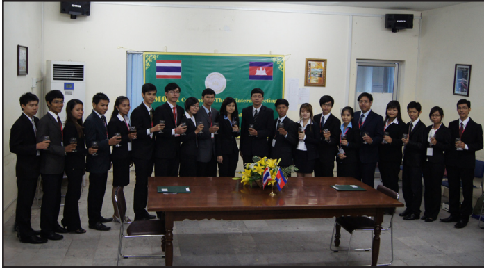
LEFT: Students from the Cambodia Party and Thailand Party posed for a photo session as part of the mock bilateral meeting.