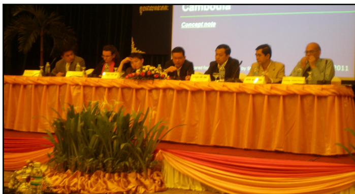
TOP: Distinguished speakers on the panel discussion BOTTOM: UC students were very excited to attend the report launch ceremony.