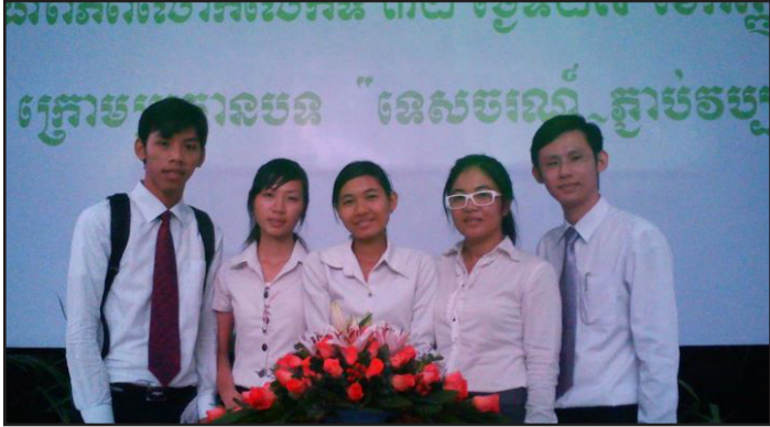
LEFT: The five students who represented UC at the discussion