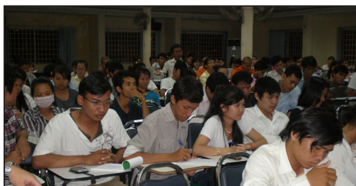
RIGHT: UC students packed the Forum, seeking wisdom and guidance on how to be successful.