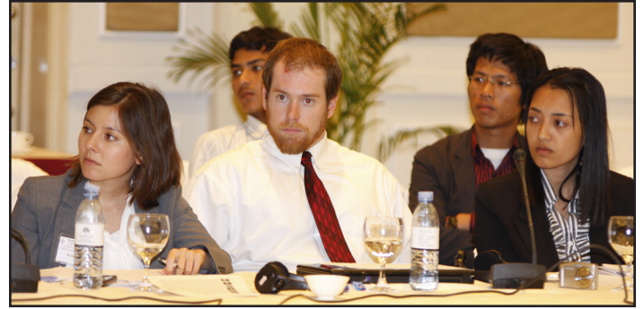
LEFT: Young leaders were recognized at the 7 th AEF.